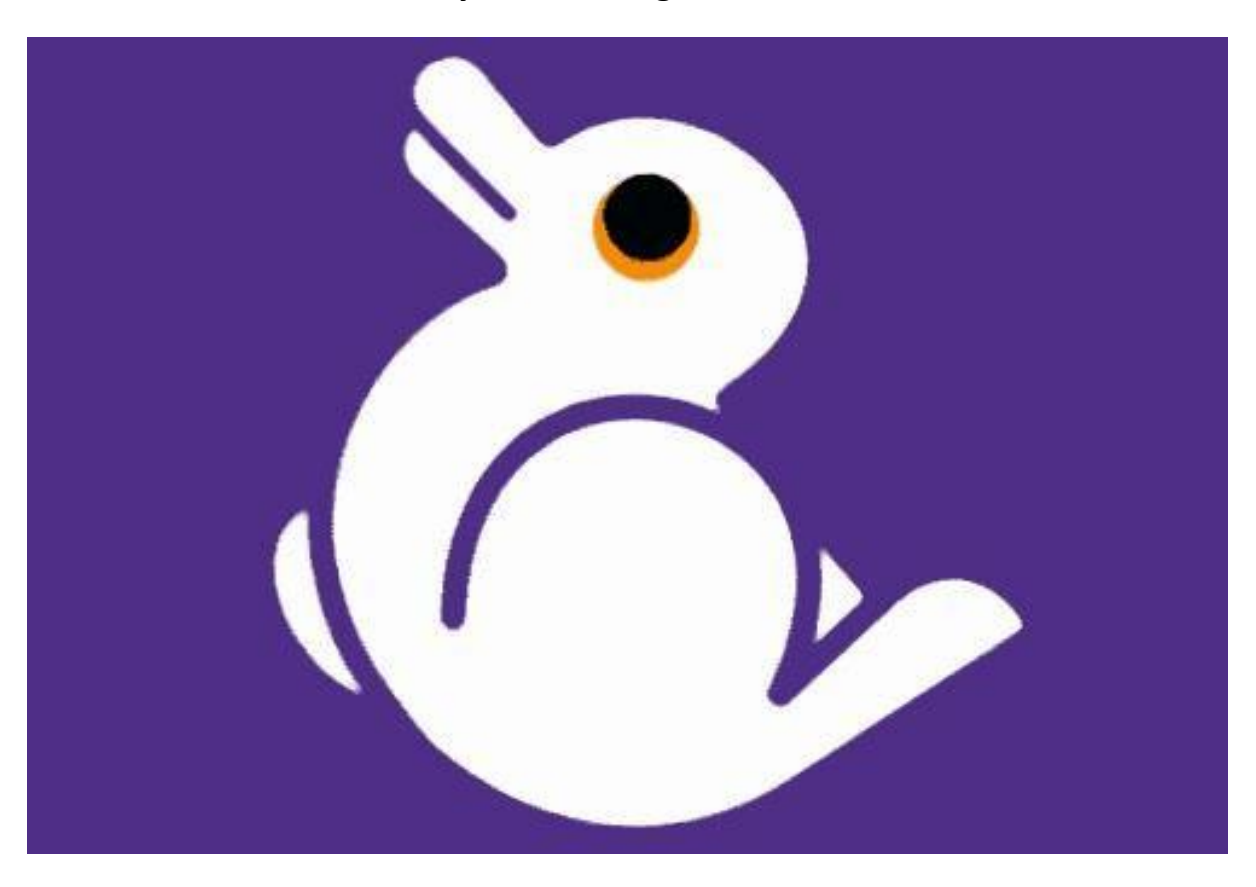
Do you see a duck or a rabbit?