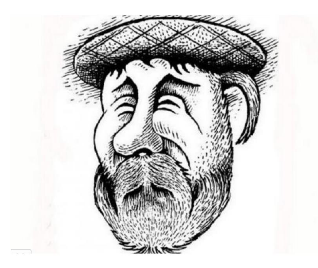
Do you see a dog with a bone or a man?