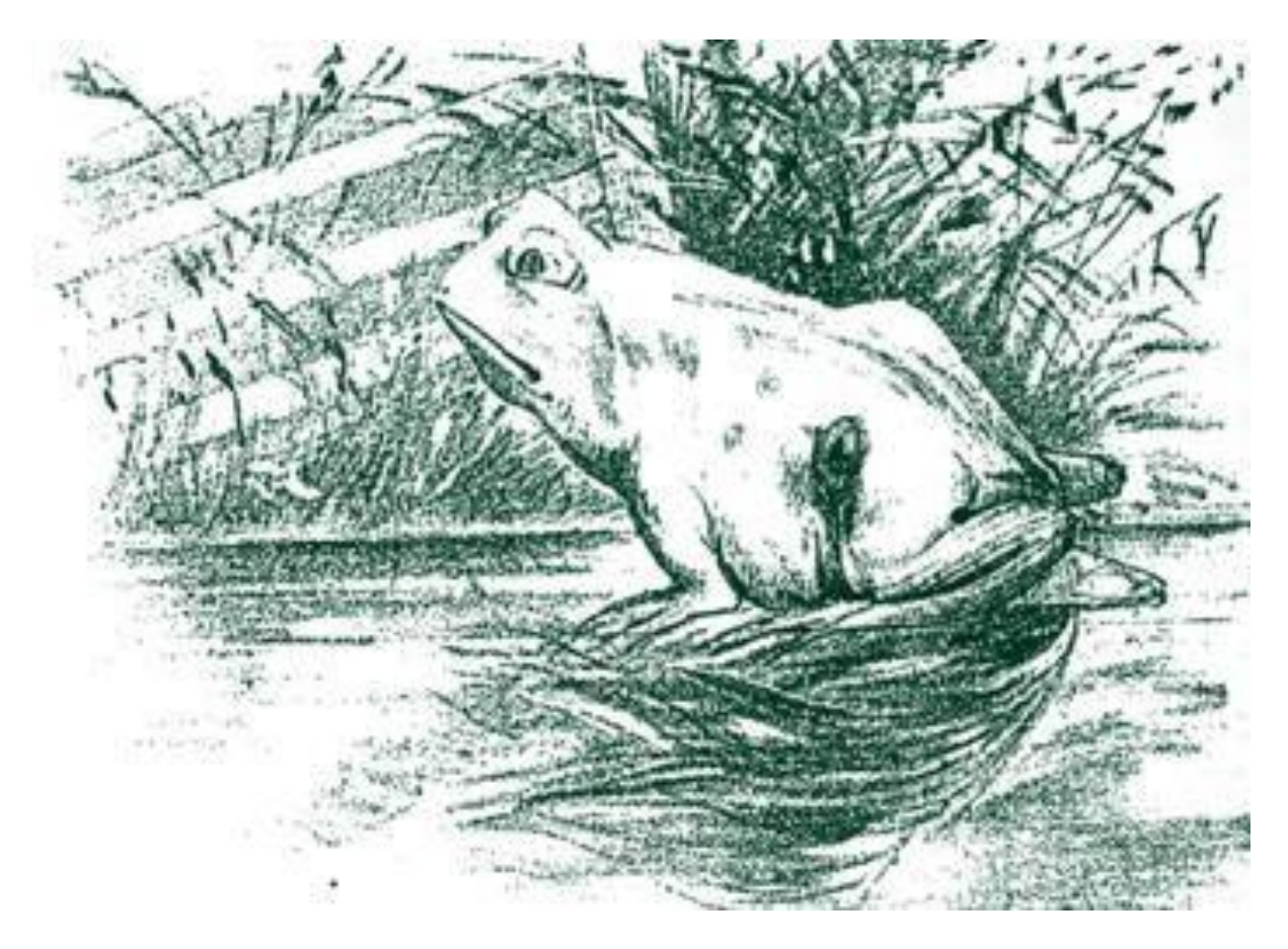
Do you see a frog or a horse?