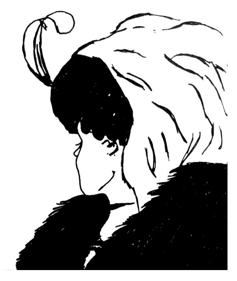
Do you see a young woman or an older woman?