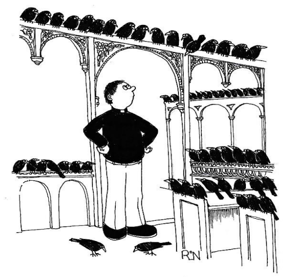
Where was the social distancing?