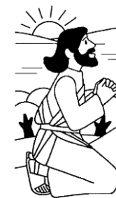
Jesus Prays in the Garden John 17:1-28